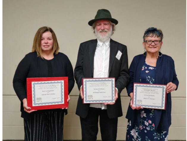
5,000 word category Prize Winners: