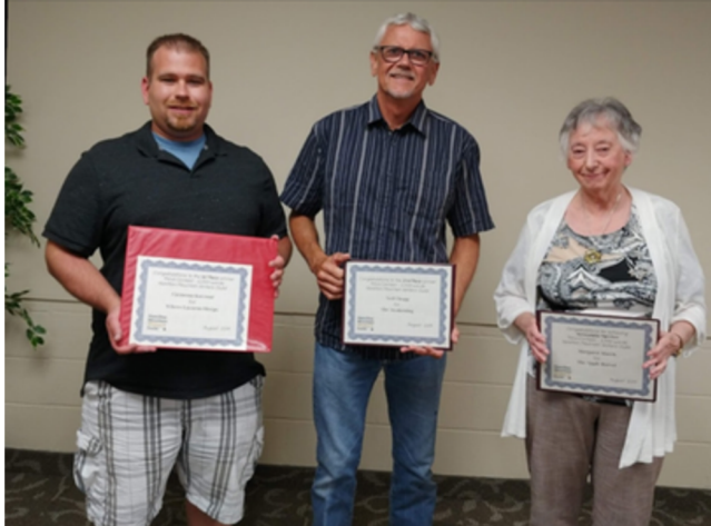
2,500 word category Prize Winners: