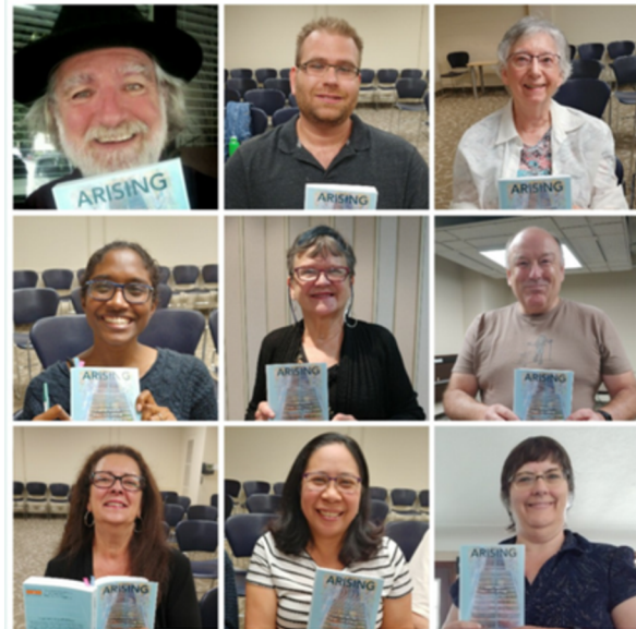
Some of our proud storytellers who were a part of our third publication.

Check out this link for a copy of Volume 3: https://www.amazon.ca/Arising-Hamilton-Mountain-Writers-Guild/dp/1775060144